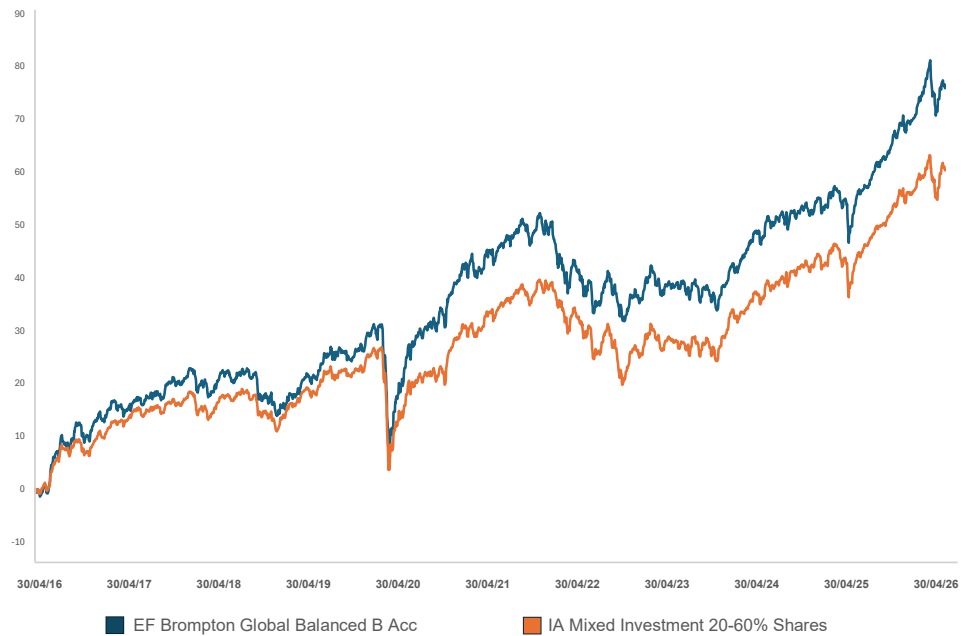
EF Brompton Global Balanced B Acc v IA Mixed Investment 20-60% Shares

Source: LSEG Lipper, NAV-NAV, sterling, net income reinvested Past performance is not an indicator of future performance