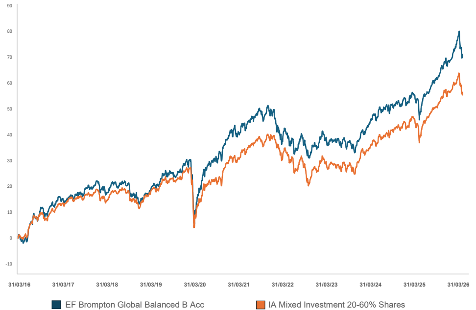
EF Brompton Global Balanced B Acc v IA Mixed Investment 20-60% Shares

Source: LSEG Lipper, NAV-NAV, sterling, net income reinvested Past performance is not an indicator of future performance