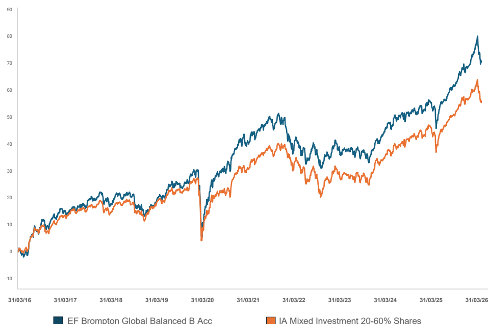
EF Brompton Global Balanced B Acc v IA Mixed Investment 20-60% Shares

Source: LSEG Lipper, NAV-NAV, sterling, net income reinvested Past performance is not an indicator of future performance