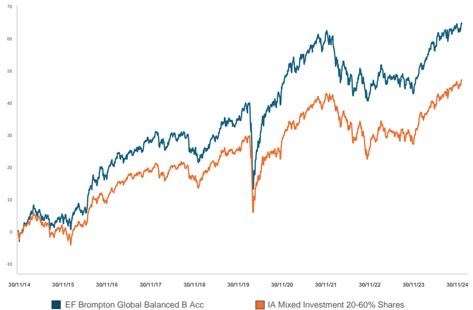
EF Brompton Global Balanced B Acc v IA Mixed Investment 20-60% Shares

Past performance is not an indicator of future performance