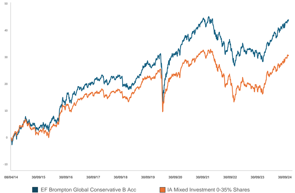
EF Brompton Global Conservative B Acc v IA Mixed Investment 0-35% Shares

Source: Lipper, NAV-NAV, sterling, net income reinvested Past performance is not an indicator of future performance