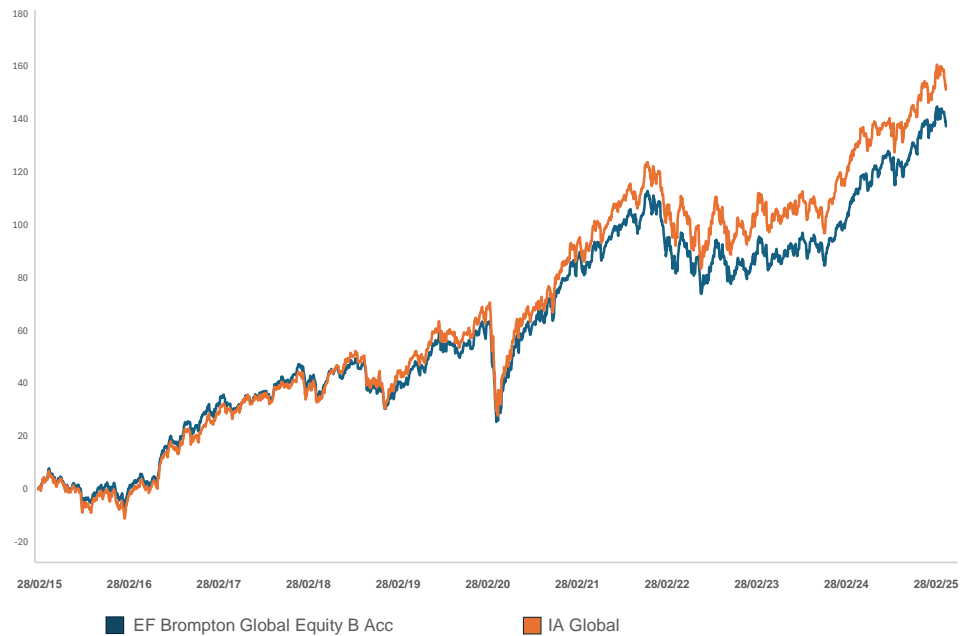
EF Brompton Global Equity B Acc v IA Global

Source: LSEG Lipper, NAV-NAV, sterling, net income reinvested Past performance is not an indicator of future performance