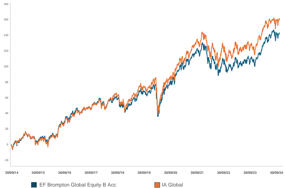
EF Brompton Global Equity B Acc v IA Global

Source: Lipper, NAV-NAV, sterling, net income reinvested Past performance is not an indicator of future performance