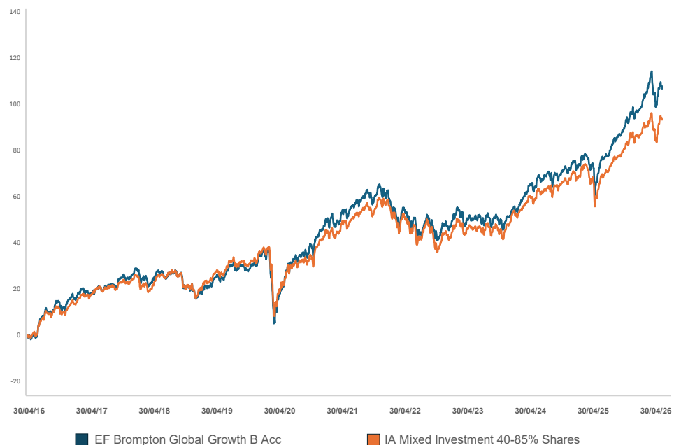
EF Brompton Global Growth B Acc v IA Mixed Investment 40-85% Shares

Source: LSEG Lipper, NAV-NAV, sterling, net income reinvested Past performance is not an indicator of future performance