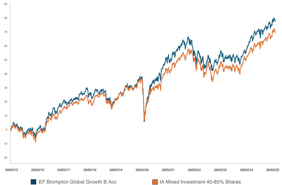
EF Brompton Global Growth B Acc v IA Mixed Investment 40-85% Shares

Source: LSEG Lipper, NAV-NAV, sterling, net income reinvested Past performance is not an indicator of future performance