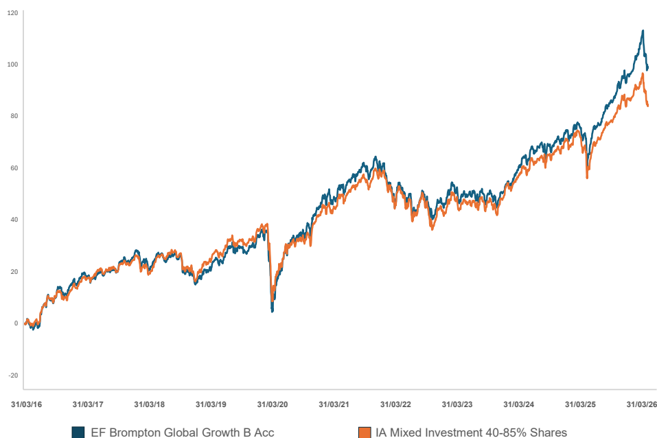
EF Brompton Global Growth B Acc v IA Mixed Investment 40-85% Shares

Past performance is not an indicator of future performance