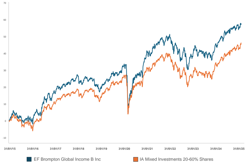
EF Brompton Global Income B Inc v IA Mixed Investment 20-60% Shares

Past performance is not an indicator of future performance