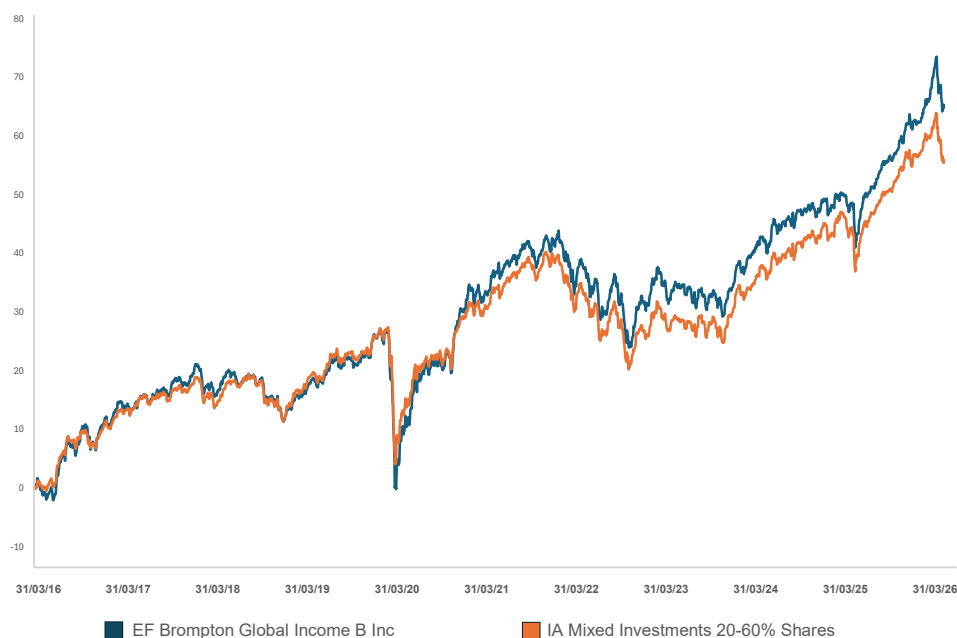
EF Brompton Global Income B Inc v IA Mixed Investment 20-60% Shares

Past performance is not an indicator of future performance