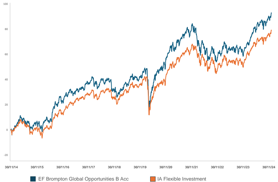
EF Brompton Global Opportunities B Acc v IA Flexible Investment

Source: LSEG Lipper, NAV-NAV, sterling, net income reinvested Past performance is not an indicator of future performance