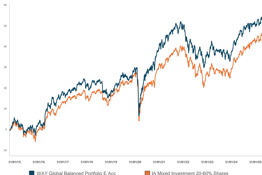
WAY Global Balanced Portfolio E Acc* v IA Mixed Investment 20-60% Shares

Source: LSEG Lipper, NAV-NAV, sterling, net income reinvested Past performance is not an indicator of future performance