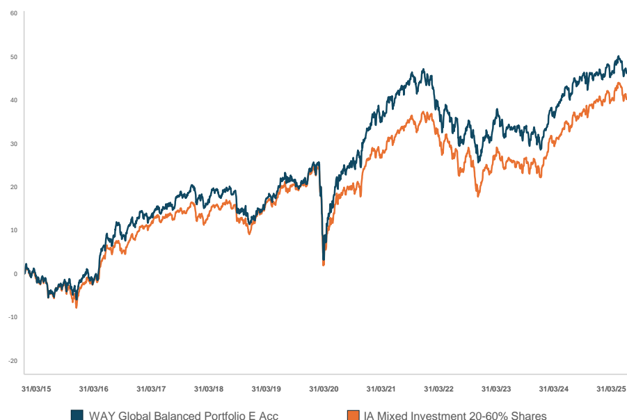
WAY Global Balanced Portfolio E Acc* v IA Mixed Investment 20-60% Shares

Source: LSEG Lipper, NAV-NAV, sterling, net income reinvested Past performance is not an indicator of future performance