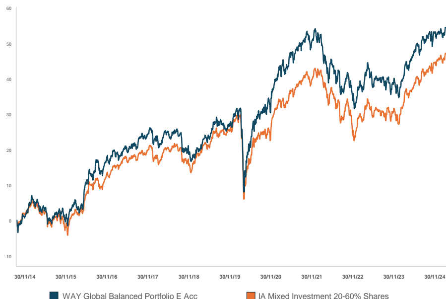
WAY Global Balanced Portfolio E Acc* v IA Mixed Investment 20-60% Shares

Source: LSEG Lipper, NAV-NAV, sterling, net income reinvested Past performance is not an indicator of future performance