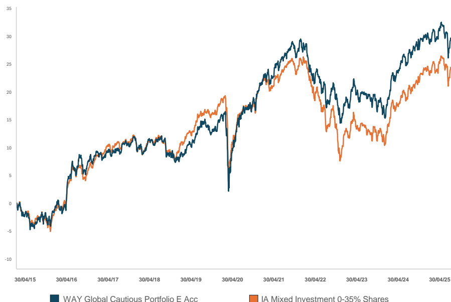
WAY Global Cautious Portfolio E Acc* v IA Mixed Investment 0-35% Shares

Source: LSEG Lipper, NAV-NAV, sterling, net income reinvested Past performance is not an indicator of future performance