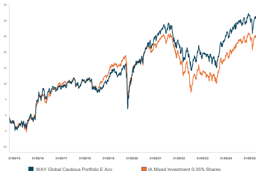
WAY Global Cautious Portfolio E Acc* v IA Mixed Investment 0-35% Shares

Source: LSEG Lipper, NAV-NAV, sterling, net income reinvested Past performance is not an indicator of future performance