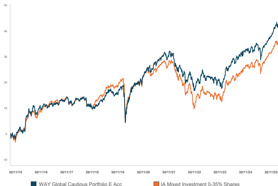
WAY Global Cautious Portfolio E Acc* v IA Mixed Investment 0-35% Shares

Source: LSEG Lipper, NAV-NAV, sterling, net income reinvested Past performance is not an indicator of future performance