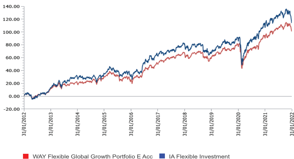
WAY Flexible Global Growth Portfolio E Acc* v IA Flexible Investment

Percentage growth for 10 years to 31 January 2022