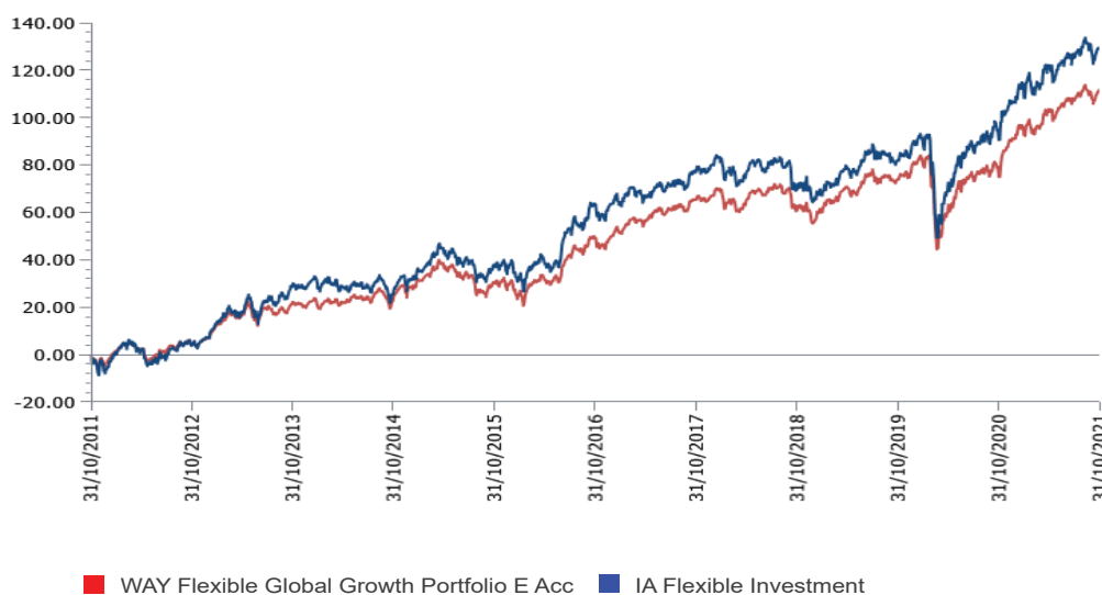
WAY Flexible Global Growth Portfolio E Acc* v IA Flexible Investment

Percentage growth for 10 years to 31 October 2021