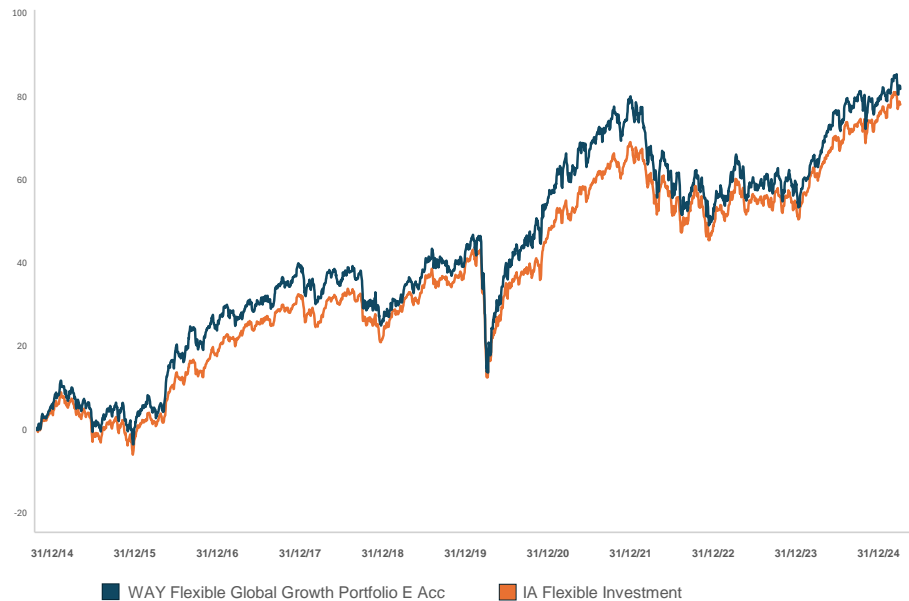
WAY Flexible Global Growth Portfolio E Acc* v IA Flexible Investment

Source: LSEG Lipper, NAV-NAV, sterling, net income reinvested Past performance is not an indicator of future performance