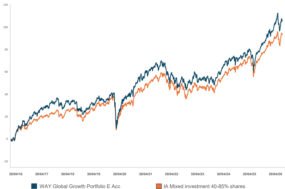
WAY Global Growth Portfolio E Acc* v IA Mixed investment 40-85% ††

Source: LSEG Lipper, NAV-NAV, sterling, net income reinvested Past performance is not an indicator of future performance