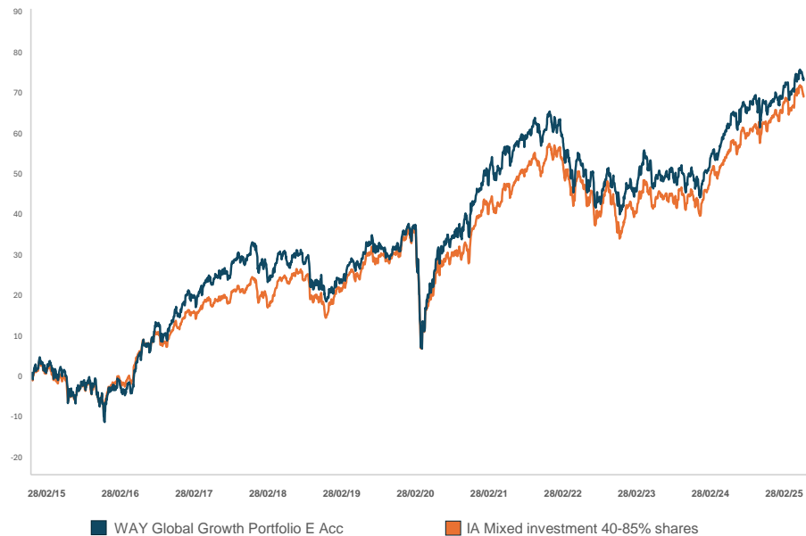
WAY Global Growth Portfolio E Acc* v IA Mixed investment 40-85% ††

Source: LSEG Lipper, NAV-NAV, sterling, net income reinvested Past performance is not an indicator of future performance