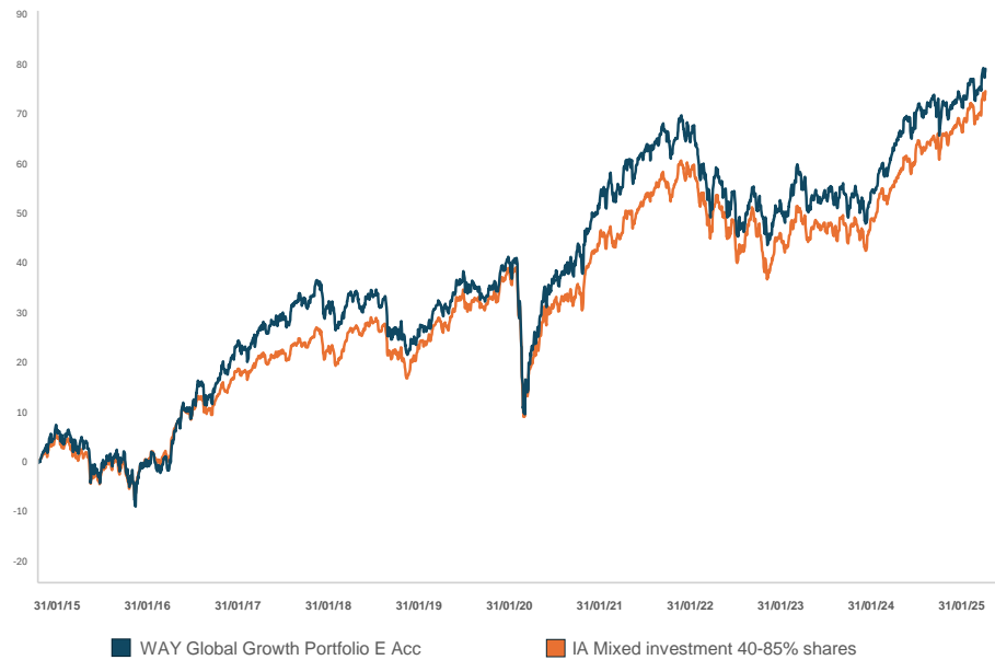
WAY Global Growth Portfolio E Acc* v IA Mixed investment 40-85% ††

Source: LSEG Lipper, NAV-NAV, sterling, net income reinvested Past performance is not an indicator of future performance