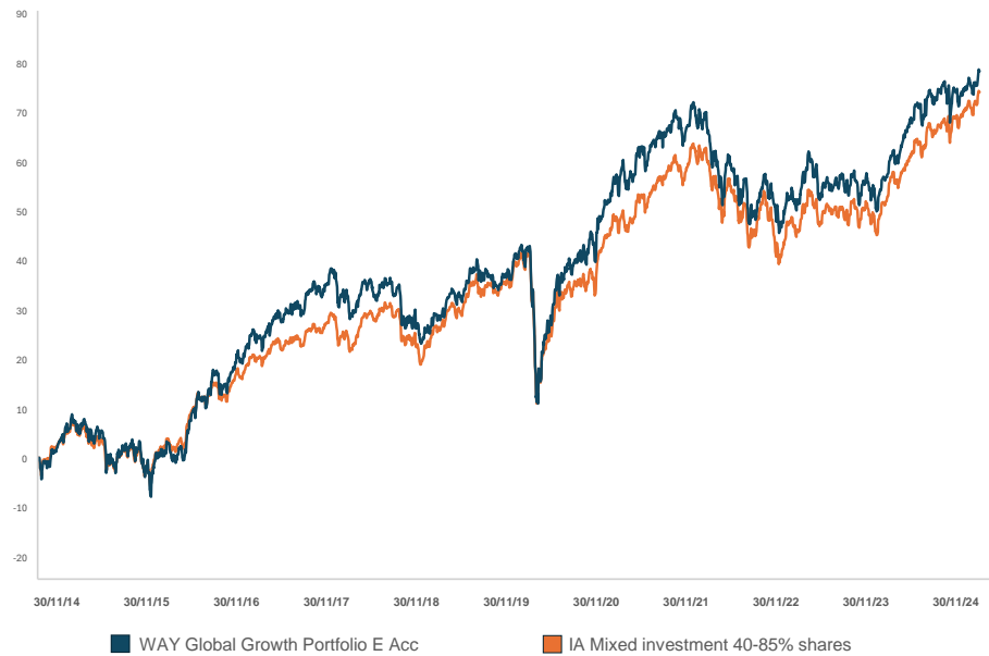
WAY Global Growth Portfolio E Acc* v IA Mixed investment 40-85% ††

Source: LSEG Lipper, NAV-NAV, sterling, net income reinvested Past performance is not an indicator of future performance