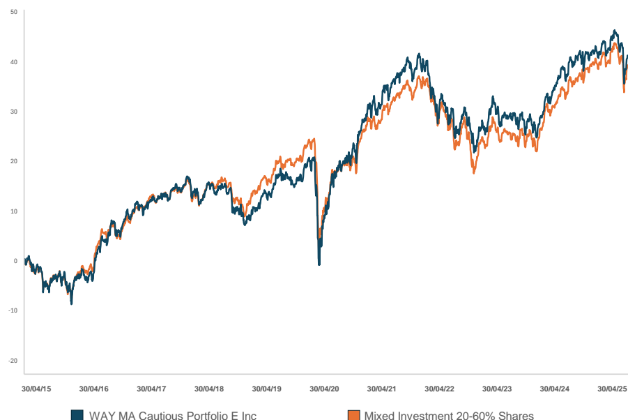
WAY MA Cautious Portfolio E Inc* v Mixed Investment 20-60% Shares

Source: LSEG Lipper, NAV-NAV, sterling, net income reinvested Past performance is not an indicator of future performance