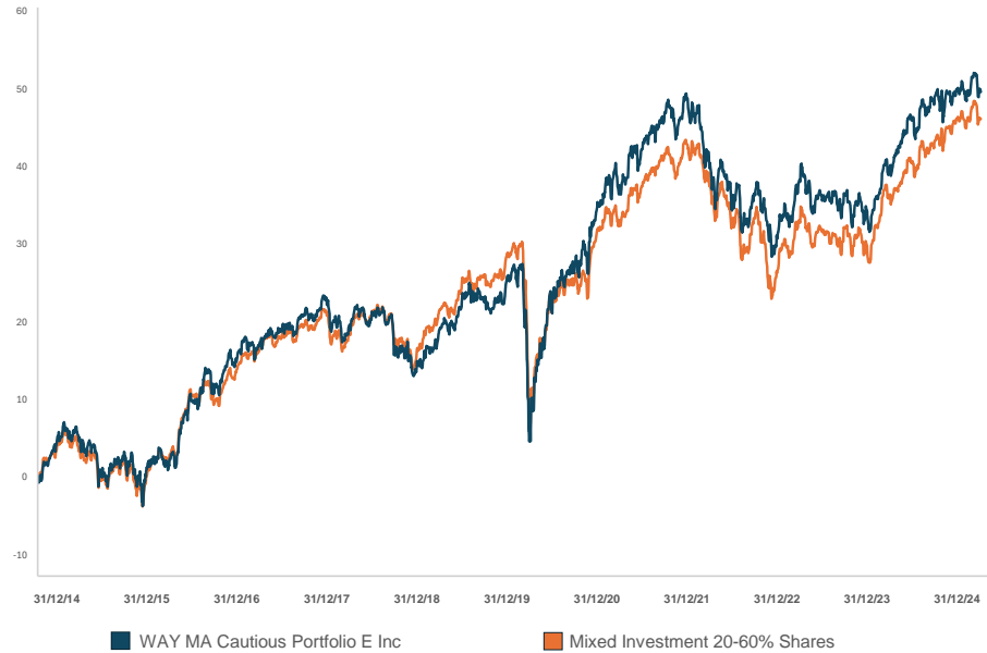
WAY MA Cautious Portfolio E Inc* v Mixed Investment 20-60% Shares

Source: LSEG Lipper, NAV-NAV, sterling, net income reinvested Past performance is not an indicator of future performance