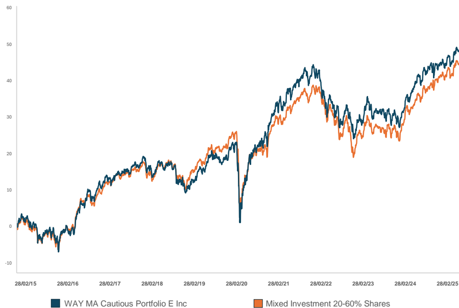
WAY MA Cautious Portfolio E Inc* v Mixed Investment 20-60% Shares

Source: LSEG Lipper, NAV-NAV, sterling, net income reinvested Past performance is not an indicator of future performance