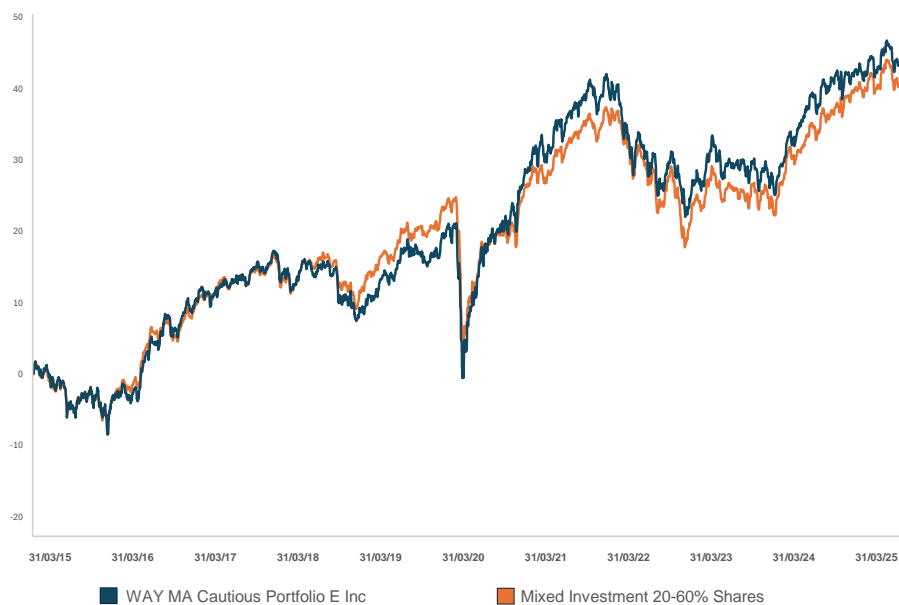
WAY MA Cautious Portfolio E Inc* v Mixed Investment 20-60% Shares

Past performance is not an indicator of future performance