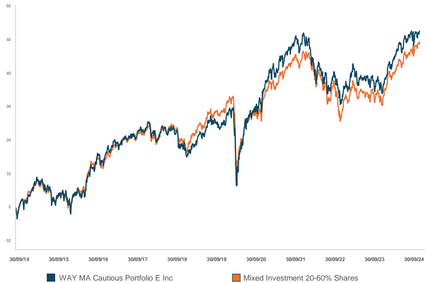
WAY MA Cautious Portfolio E Inc* v Mixed Investment 20-60% Shares

Source: Lipper, NAV-NAV, sterling, net income reinvested Past performance is not an indicator of future performance