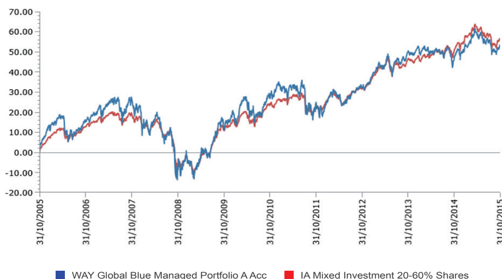
WAY Global Blue Managed Portfolio A Acc v IA Mixed Investment 20-60% Shares

Source: Lipper, NAV-NAV, sterling, net income reinvested. Past performance is not an indicator of future performance.