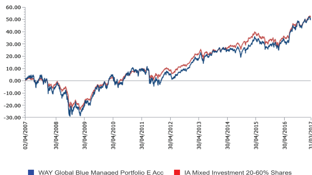
WAY Global Blue Managed Portfolio E Acc* v IA Mixed Investment 20-60% Shares

Percentage growth for 10 years to 31 March 2017