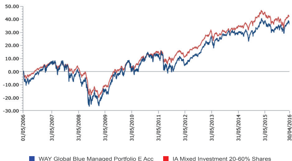
WAY Global Blue Managed Portfolio E Acc* v IA Mixed Investment 20-60% Shares

Percentage growth for 10 years to 30 April 2016