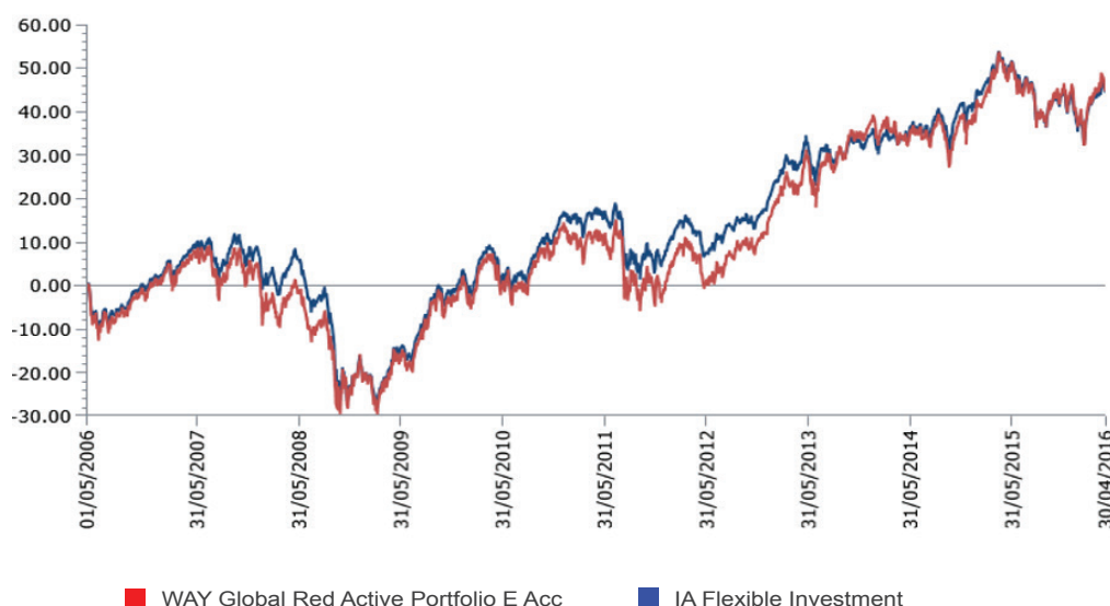
WAY Global Red Active Portfolio E Acc* v IA Flexible Investment

Percentage growth for 10 years to 30 April 2016